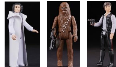
Princess Leia/Han Solo/Chewbacca

Launch date in Japan: Friday, October 4, 2019