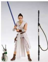
Rey & D-O/Supreme Leader Kylo Ren

Copyright: © & TM Lucasfilm Ltd. ®and/or TM & ©2018 HASBRO.