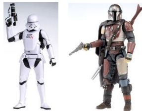
First Order Jet Trooper/Mandalorian

Launch date in Japan: Friday, October 4, 2019