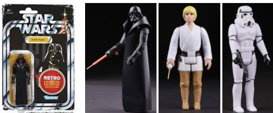
Darth Vader/Luke Skywalker/Stormtrooper

Copyright: © & TM Lucasfilm Ltd. ®and/or TM & ©2018 HASBRO.