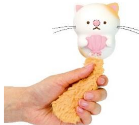
A new sensation musical pet “Sing! Nyakkoisland”