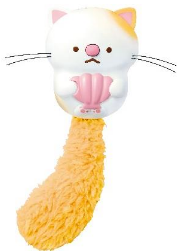
“Sing! Nyakkoisland” MIKE Nyakko

Official Website: www.takaratomy.co.jp/products/nyakkoisland