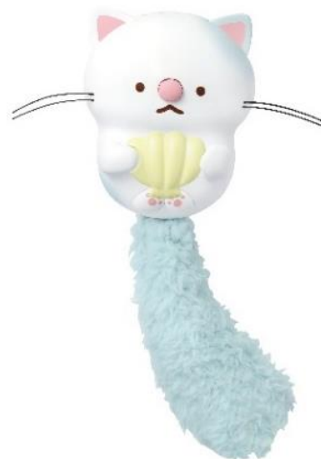
“Sing! Nyakkoisland” SORA Nyakko