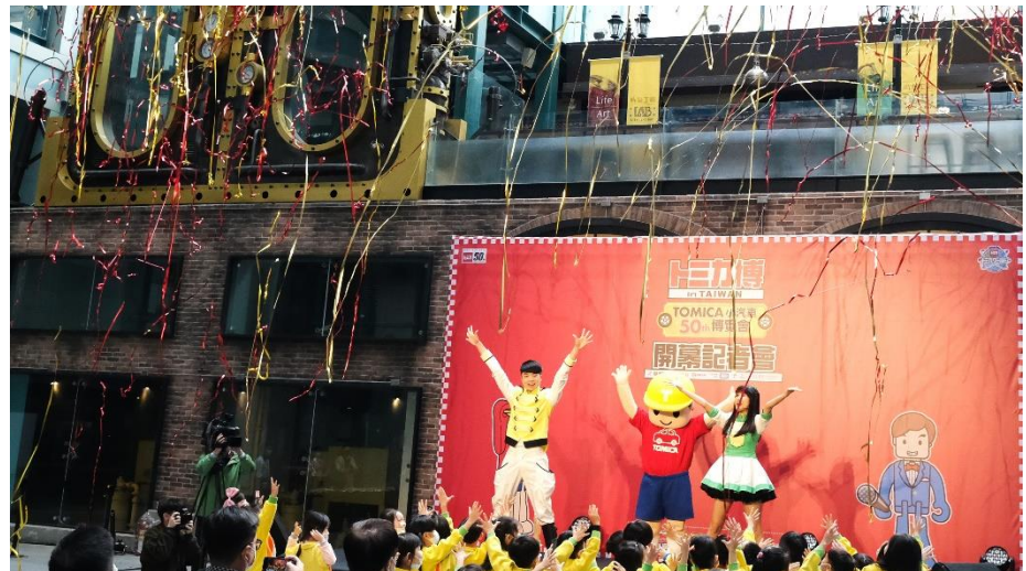
A view of the press conference stage