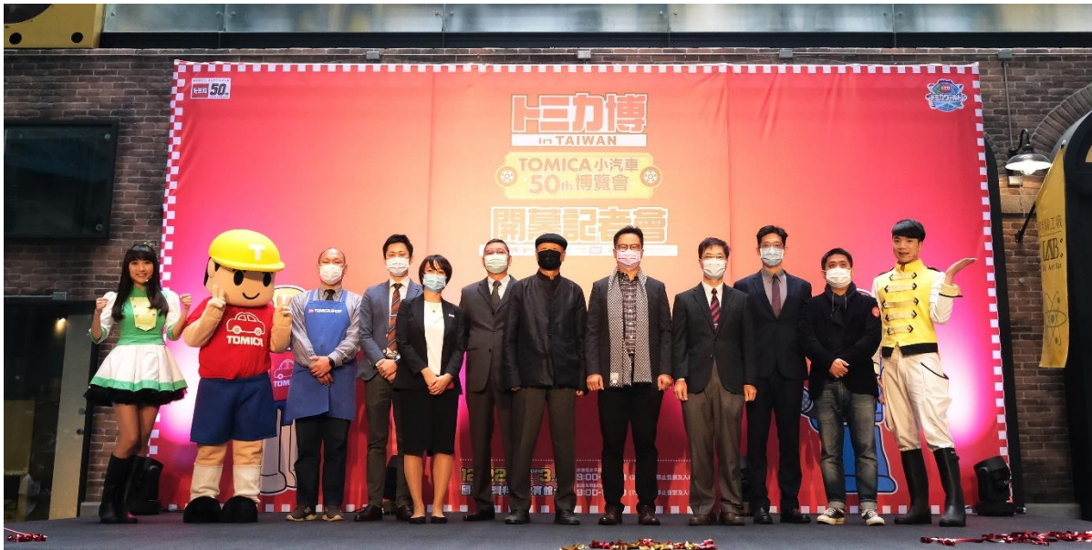
Views of displays and attractions at the venue