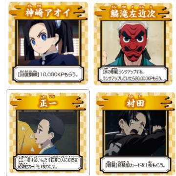
[Example of Ally Cards]