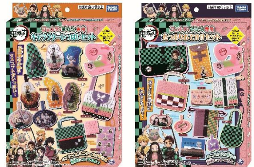
Left: Many Characters Set

Copyright: © Koyoharu Gotoge / SHUEISHA, Aniplex, ufotable © TOMY