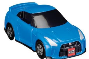
Blue “First TOMICA NISSAN NISSAN GT-R” included in the set