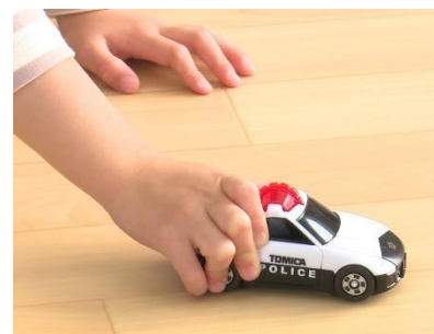
Size that is easy even for young children to hold

“First TOMICA,” which has incorporated “elements that children love” and given “consideration to ensure that even 1.5-year-old children can have fun playing with the toy safely” with technology accumulated for over 50 years since the launch in 1970, is recommended for playing with Tomica toy for the first time.