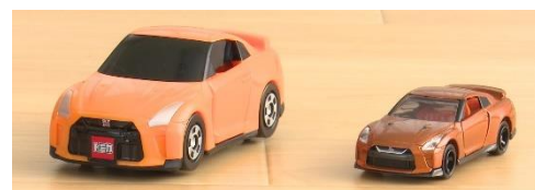
First TOMICA (left) and Tomica (right)