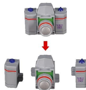
Photo on left) Includes lens shield, quantum dial, and Refraktor original camera

Photo on right) Camera split into three that recreates the TV animation