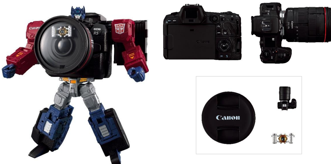
Photo above: Left and right) Recreation of the design and logo, as well the position of the buttons Photo below) Includes lens shield, matrix, and mini EOS R5