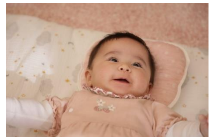
Her facial expression changes swiftly!