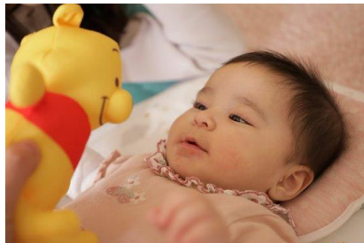
Melody plays from the “Brighten Mood Switch”...