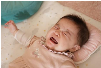
Baby starts crying...