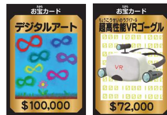
Treasure cards have also been updated to reflect the changing times