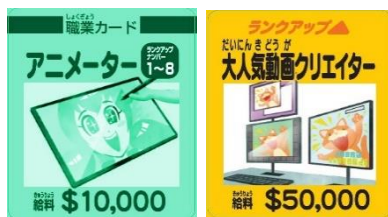
Features a total of 31 occupations