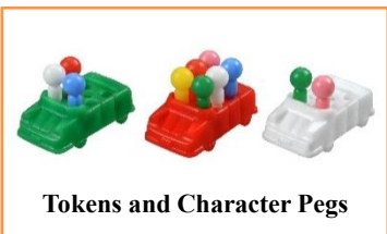
Tokens and Character Pegs

“The Game of Life” is the flagship model based on the theme of “Life is more fun when it’s filled with variety.” This is the eighth generation of the flagship model since the first generation was released in 1968, and the 73rd product in the series.