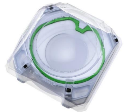
New stadium with rail