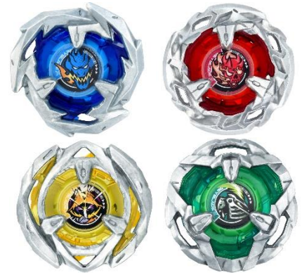
Top photo: Left: DRAN SWORD 3-60F, Right: HELLS SCYTHE 4-60T Bottom photo: Left: WIZARD ARROW 4-80B, Right: KNIGHT SHIELD 3-80N