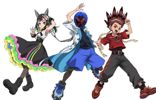
Image visual of the TV animation