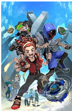
Manga key visual

Broadcasting is scheduled to begin in the fall of 2023 on the network of six broadcast stations affiliated with TV TOKYO