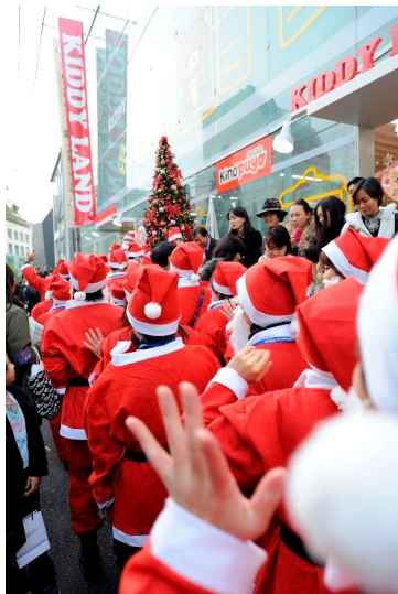
Santa Claus Apprentices Arriving at Kiddy Land