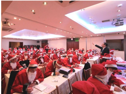
Santa Claus Lecture: The Foundations of Santa Claus