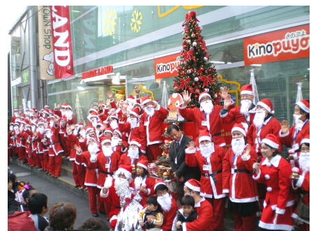
77 Santa Claus Apprentices at Kiddy Land Harajuku