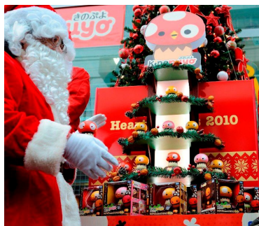
A Santa Apprentice completes the Kinopuyo Christmas Tree