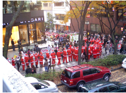
Santa Claus Practical Exam: A March through town.