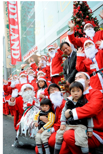
Santa Claus Apprentices pose for a group photo