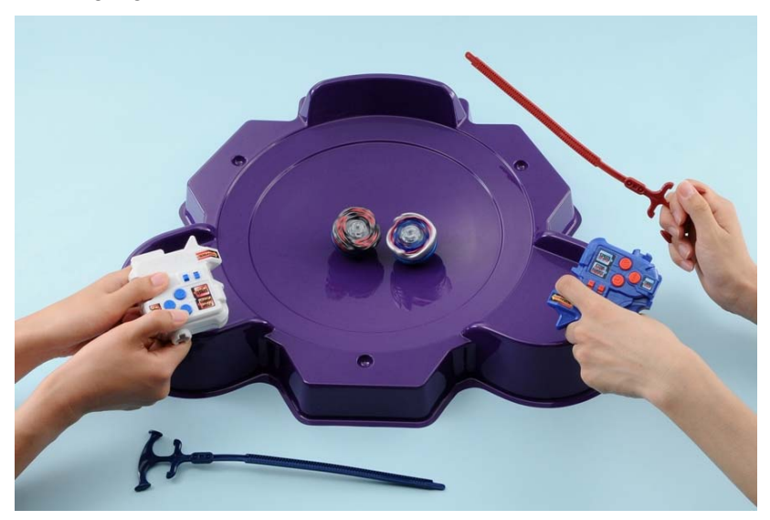
<u>Super Control Beyblade</u> Right: BBC01 BIG BANG PEGASIS Left: BBC02 L-DRAGO DESTROY JPY 3,885 Super Control Beyblade exclusive Bey Stadium JPY 2,100