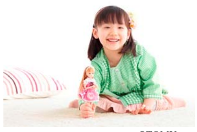
©TOMY Licca-chan fan spokesperson and child celebrity, Mana Ashida

Following the disasters in Japan, games which allowed family and friends to get together for fun and conversation have been increasingly popular. Such games have shown major sales increases, with April-September shipments of TOMY's popular board game series, Jinsei Game<sup>2</sup> up 20%, shipments of the table-top action game Kurohige Kiki Ippatsu <sup>3</sup> and strategy action game Jenga up 40% versus the same period in 2010 and all series have shown overall increases versus last year. People have flocked to these games, noting that they can contribute to electricity conservation as families gather into one room to play and their simple rules allow people of any age to enjoy them.