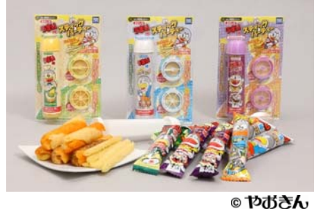
Okashi Na Umaibo Stick Party (From T-ARTS) Three varieties SRP ¥699 (incl. tax), launched December, 3, 2011

Beer Hour (From T-ARTS) Four colors SRP ¥1,995 (incl. tax), launched May, 19, 2011