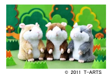
Mimicry Pet (From T-ARTS) Seven varieties * Picture: 3 colors of Hamsters SRP ¥2,940 (incl. tax), launched March, 3, 2011