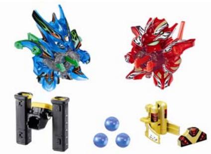
© TOMY d-rights, WBMA, TV TOKYO Cross Fight B-Daman: CB-23 Cho-Kaizo Set Power & Rensha SRP ¥2,625 (incl. tax), Launched Nov. 12, 2012