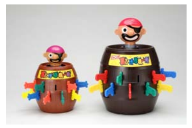
(L) Kurohige Kiki Ippatsu (Pop Up Pirate) SRP ¥1,885 (incl. tax), on sale now.

© 2011 Hasbro. All Rights Reserved. Jenga(R) is a registered trademark of Pokonobe Associates. © 2011 Pokonobe Associates.