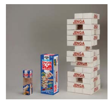
(L) Jenga SRP ¥2,079 (incl. tax), on sale now.

© 1968, 2011 Hasbro. All Rights Reserved.