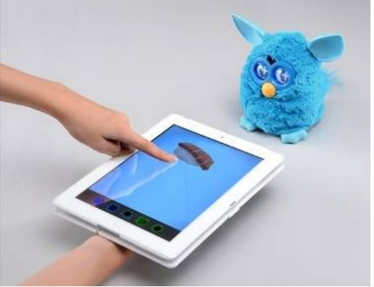
Compatible with iPad®, iPod touch®, iPhone®

1 Bimajo (literally, "beautiful witch" in Japanese) is used to describe women over 35 whose "ageless beauty" defies their years. ©TOMY Page 1 of 5