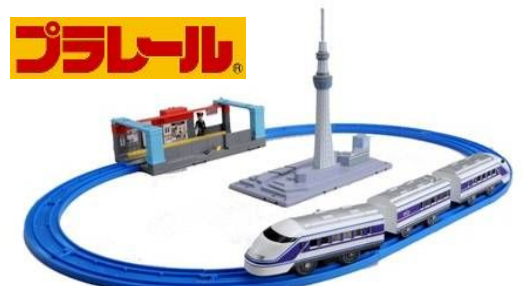
©TOKYO-SKY TREE. Used under license from Tobu Railway © TOMY \vec{J} \ni \nu - \nu and Plarail are registered trademarks of TOMY

This high-rise parking structure makes it loads of fun to park Tomica diecast vehicles. It has a battery powered automatic elevator that spins the cars round and round as they go up or down and get off to park on any floor and of course, the elevator can also be operated by hand. From the top of the elevator, Tomica cars get off to zip down the spiral slope, which kids will want to do again and again. For even more Tomica fun, Tomica City Parking connects to the 4-story Super Auto Tomica Building (sold separately, JPY 6,279 incl. tax).