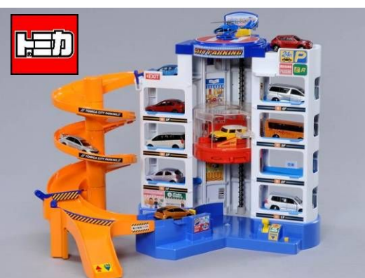
Tomica Diecast cars sold separately ©TOMY