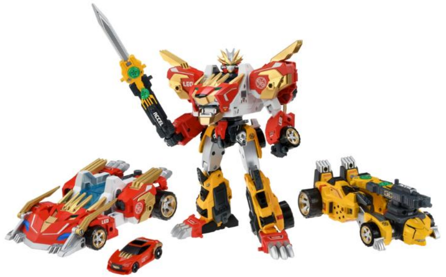
“Tomica Kizuna Gattai EARTH GRANNER” toy series