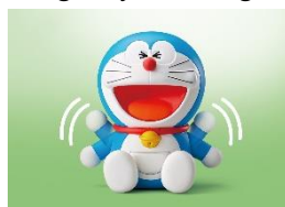
Very delighted and throws its arms