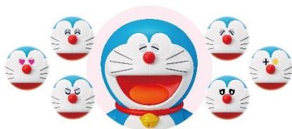
An expression in its eyes changes in 27 patterns.

With 27 patterns of looks in liquid crystal color eyes, its expression changes according to a chat or situation. In addition, as its arms move up and down and the body rotates from side to side, various emotional expressions are realized, like delight by throwing its arms or surprise by fluttering.