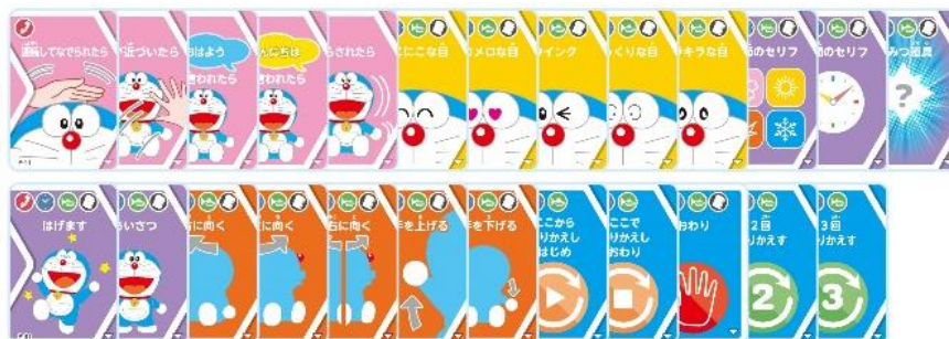
and put his right hand up