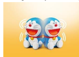
Surprised and flutters