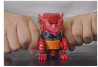
Pull the trigger on the back to shoot!

With the three shooters “ BOT-01 Colamaru ”, “ BOT-02 Aquasports ” and “ BOT-03 Gyokurock ”, you can enjoy shooting and battles by setting the plastic bottle cap in the main body, and pulling the trigger on the back to shoot. There are 3 shooting types of power, speed and control, with each model shooter equipped with one ability. In addition to experiencing the exhilaration of shooting that kids love, each shooter is designed in the motif of a beverage, in a comical and cool-looking style appealing to elementary school students.