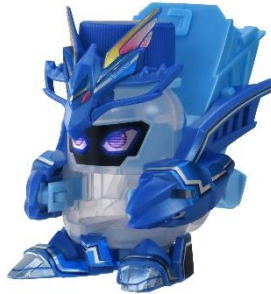
Speed-type BOTTLEMAN! “BOT-02 Aquasports”