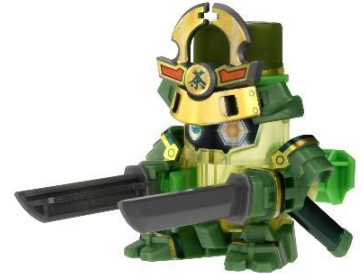
Control-type BOTTLEMAN! “BOT-03 Gyokurock”