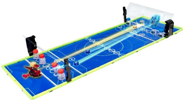
“Target Shooting” (multiplayer battle)