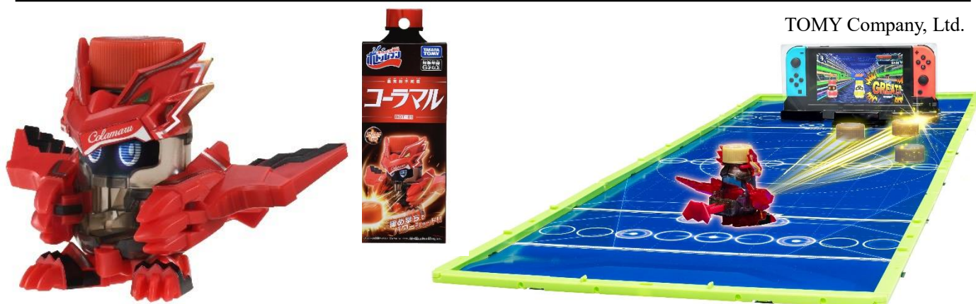
Main character shooter “BOT-01 Colamaru”

Original animation will also air on TOMY Company Official YouTube channel from Friday, October 9, 2020!