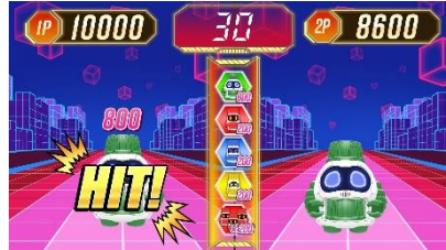
“Score Attack” (for two players)