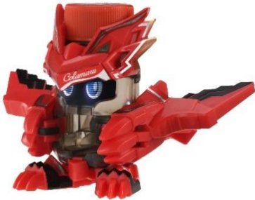
Power-type BOTTLEMAN! “BOT-01 Colamaru”