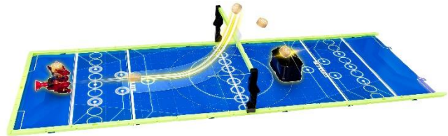
“Basketball” (individual sports)