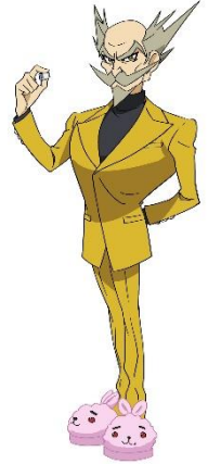
Cota Coga (main character)