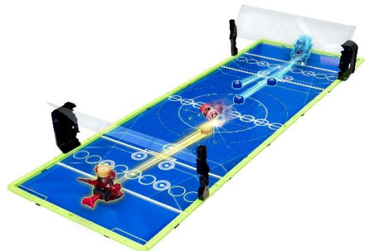
“Push Bottle” (multiplayer battle)