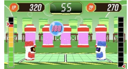
“Botminton” (for two players)