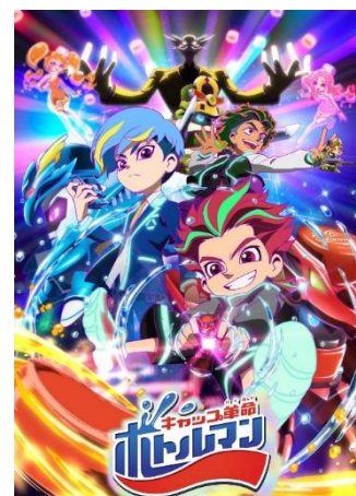
The ‘BOTTLEMAN’ animation is also starting!

The sensor mounted on Nintendo Switch recognizes the position and strength of the bullet that BOTTLEMAN shot at the target, and it is reflected in the score, so you can experience revolutionary play that has never been available before.