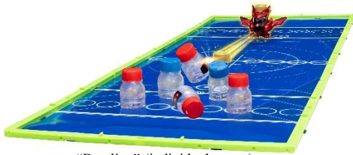
“Bowling” (individual sports)