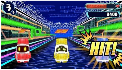
“Drink Quest” (for one player)