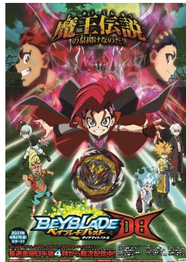
A new series of animation will also begin!

TOMY Company, Ltd. (Representative Director, President & COO: Kazuhiro Kojima, headquarters: Katsushika-ku, Tokyo) has rolled out “Beyblade” modernized bei-goma (traditional Japanese tops) battling tops since 1999 in more than 80 countries and territories around the world. The cumulative shipment volume of “Beyblade” has now reached 500 million units (*)1 . (as of February 28, 2021) 500 million Beyblade units lined up side by side in a straight line would add up to approximately 25,000 km, (*)2 which is equivalent to the length of roughly 11 Japanese archipelagoes north to south.