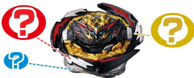
The unit will “evolve”!