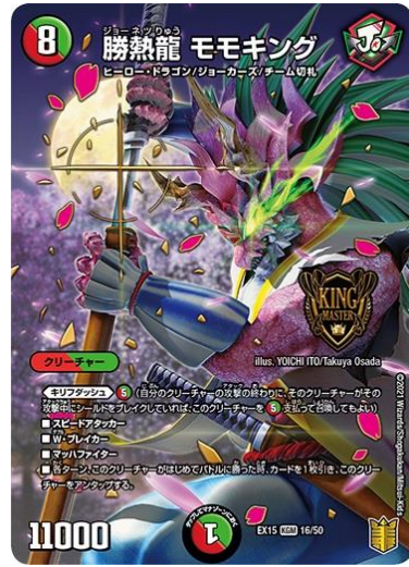
[Jonetsu Ryu, Momoking]

“Bolshack Crisis NEX” (left) is an extremely popular, rare card, which was sold in the “Black Box” pack only once in the past. It is featured again with a special illustration. Besides, this product features many collectable cards with illustrations and CG of the manga and animation.