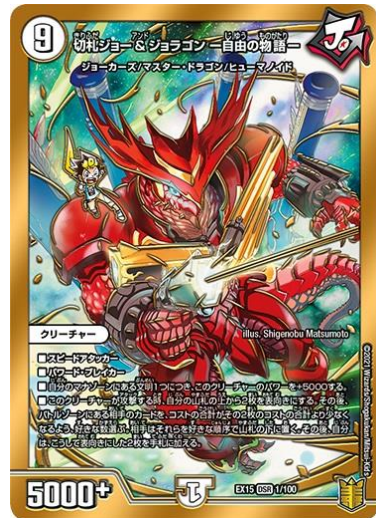
[Jo Kirifuda & Joragon – story of freedom–]

Classic, popular creatures who excelled as a trump card for past protagonists have been powered up. Illustrations were newly drawn by Shigenobu Matsumoto, the creator of the original manga. Actual cards are a gold-framed foil version.