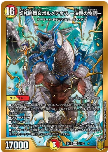
[Shobu Kirifuda & Bolmeteus – story of duel–]

“Bolshack Crisis NEX” (left) is an extremely popular, rare card, which was sold in the “Black Box” pack only once in the past. It is featured again with a special illustration. Besides, this product features many collectable cards with illustrations and CG of the manga and animation.