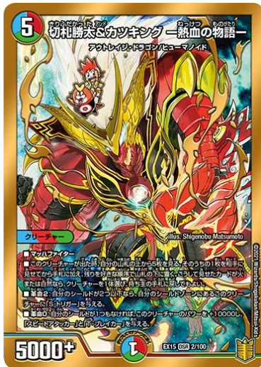
[Katta Kirifuda & Katsuking – story of hot blood–]