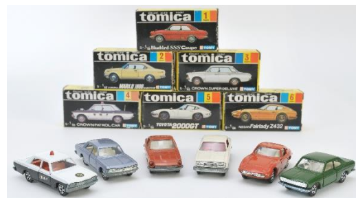
Lineup of the first generation of six different “Tomica” mini toy cars