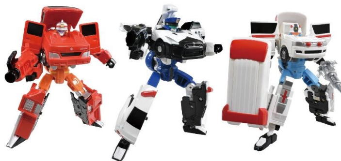
Robots that have transformed from cars (From left) “Fire Engine,” “Patrol Car,” “Himedic”