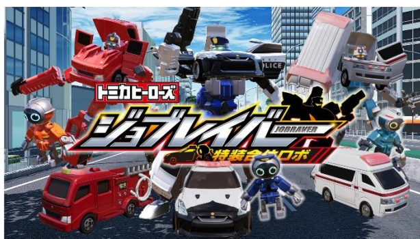
Key visual of “TOMICA Heroes Jobraver - Specially-equipped combined robot”