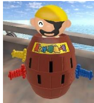
Pop-Up Pirate MAX5 Color (800 cluster coins)

*Press the emote button and the color of the bandana changes (5 colors).