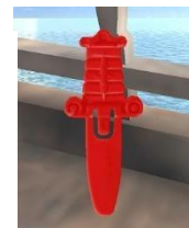
Sword (500 cluster coins)

*Press the emote button and the color of the bandana changes (5 colors).