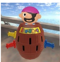
Pop-up Pirate (800 cluster coins)

Selling original avatars for “Pop-Up Pirate,” “Pop-Up Pirate MAX5 Color,” and “swords.”