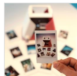
The popular Photo in Photo!