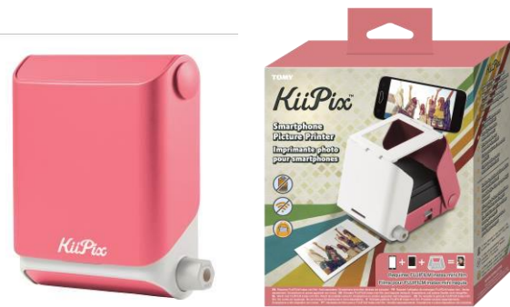
The product and packaging to be released overseas

Launched in Japan in December 2017, the Printoss attracted attention for its incredible success, selling out as soon as it was delivered to physical and online stores alike. After such immense popularity, it has been slated for release overseas too. Reasons for the Printoss's popularity include its compact size with no need for batteries or a specific app, the fact that it enables immediate, easy printing, the fact that users can print original photos that they have processed themselves, the way the analog finish provides an even fresher look and the fact that users can enjoy sharing their photos on social media. Users are mainly in their teens to 30s, particularly women in their 20s. Consumers themselves have broadened the range of uses, using the Printoss to print photos of their favorite anime characters and celebrities, and event using Printoss photos in place of business cards.