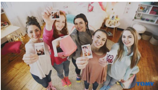
Promotion movie to be used overseas