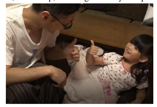
Putting Nerun (Cozy Dozy) to bed was a success!

Super Daddies were asked to take videos at home on how they tried to "put Nerun (Cozy Dozy) to bed with their children." Scenes of how dads and their children enjoyed "putting Nerun (Cozy Dozy) to bed" by communicating could be seen. Dads encouraged their children by calling out, "See if you can put Nerun (Cozy Dozy) to bed," "Shall we put the blanket on?" "Why not try sleeping together?" "How can we close its eyes (have it fall asleep)?" "Looks sleepy," "Oh, it woke up," etc. Together they also patted the head, calling out "Shhh!" to be quiet.