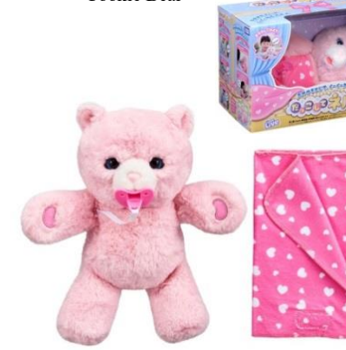
Dakkosite Nerun (Cozy Dozy) Peach Bear