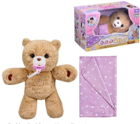
Dakkosite Nerun (Cozy Dozy) Cookie Bear

Website: www.takaratomy.co.jp/products/nerun/