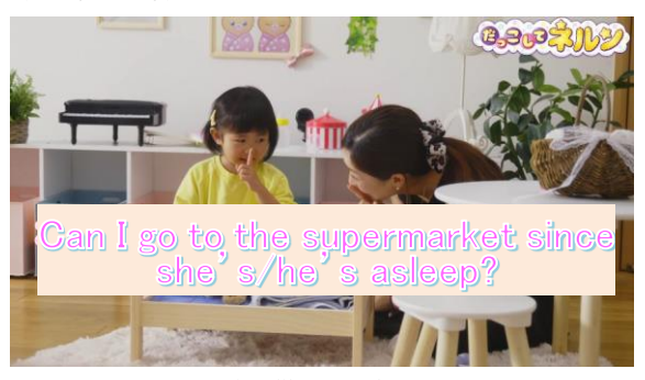
Do just like mom does...

TOMY Company celebrated the 95th anniversary of its founding on February 2, 2019