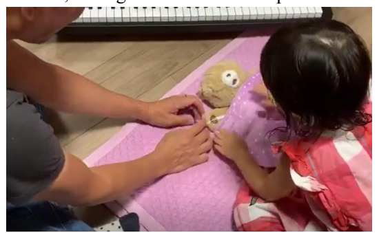
Try putting Nerun (Cozy Dozy) to bed with dad!