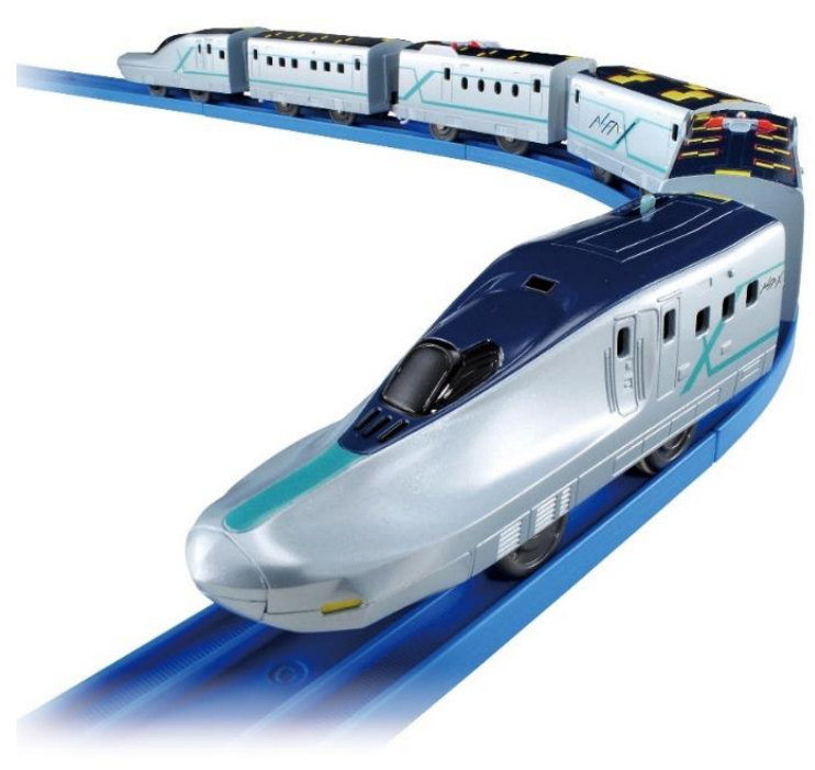
PLARAIL "Ippai Tsunago Shinkansen Test Train ALFA-X"

"ALFA-X" (E956 Shinkansen test train) is a test train developed by East Japan Railway Company (JR East) to realize a next-generation Shinkansen train with an aim to provide new values in addition to offer safe and high-speed means of travel. The test run is mainly performed in sections between Sendai and Shin-Aomori of the Tohoku Shinkansen Line.