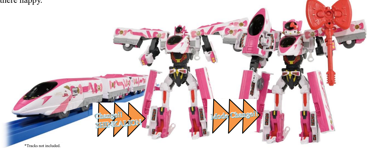
From the left: Shinkansen Mode, SHINKALION Mode, and Hello Kitty Mode

It changes into "Hello Kitty Mode" by putting "Hello Kitty Mask" with a motif of Hello Kitty's face over its head and making it hold "Ribbon Stick." "Ribbon Stick" is a ribbon-shaped stick decorated with fine glitter and a very Hello Kitty item with the setting in the story that "with a wave of the stick, it can make all people who are there happy."