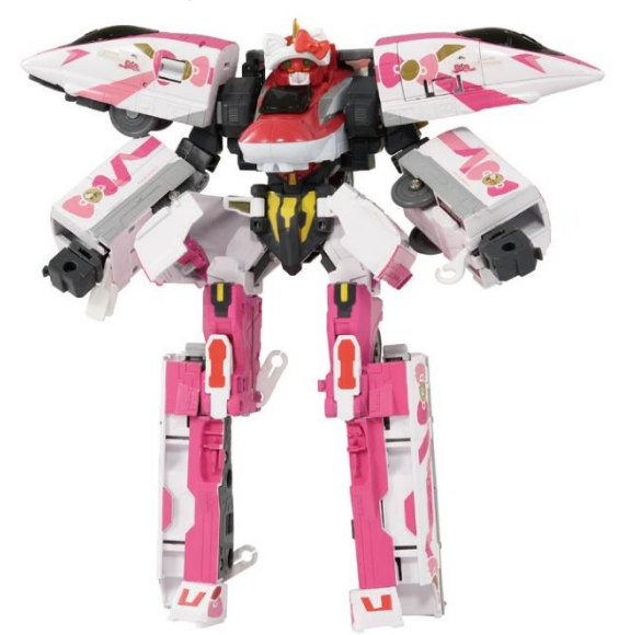
Example of combination with SHINKALION E6 Komachi

Making "Cross Combination" with the first car of a separately sold Deluxe Shinkalion Series toy(*) powers it up to be a large SHINKALION that consists of a total of five cars. At the time of Cross Combination, a cute after-combination appearance can be made by putting "Headgear (SHINKALION HELLO KITTY spec)," a cute head part with a motif based on Hello Kitty's ears and ribbon.