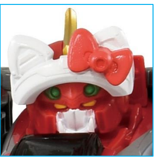
Upper: Headgear (SHINKALION HELLO KITTY spec) Lower: example of putting the Headgear (SHINKALION E6 Komachi)

(*) Among E5 / E6 / E7 / E3 / N700A / H5 / 800 / Black / E3 Iron Wing / Black Kurenai / 923DY / ALFA-X of Deluxe Shinkalion Series, the first car of one model is used. (Some models are no longer produced.)