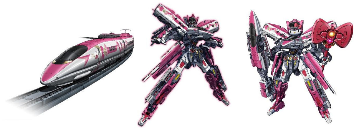
Design in the animation (from the left: Shinkansen Mode, SHINKALION Mode, and Hello Kitty Mode)