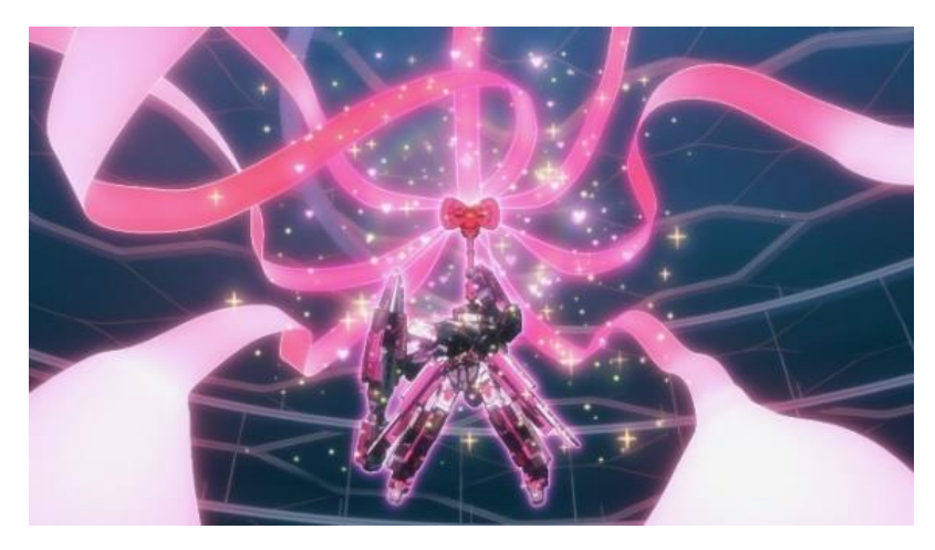
Original collaboration animation photo of a scene

Moreover, "SHINKALION HELLO KITTY" can also make a mode change into the cool but cute "Hello Kitty Mode," which wears "Hello Kitty Mask," and make lovely Cross Combination with separately sold SHINKALION toys.