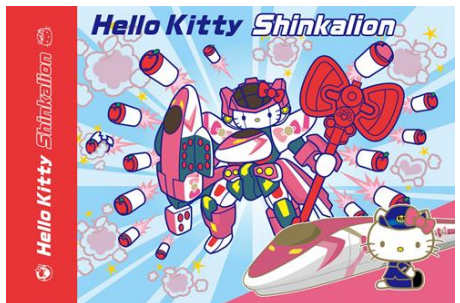
Collaboration illustration drawn on the back of the package