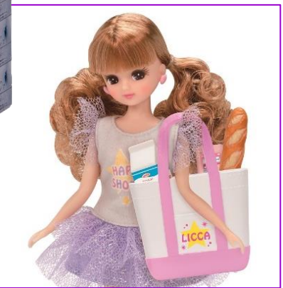
A separately available doll "LD-14 Happy Shopping" comes with a shopping bag, a substitute for a plastic bag.