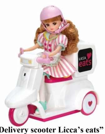
"Delivery scooter Licca's eats" *The doll and the dress are not included.

"Licca Shopping Park" and "Delivery scooter Licca's eats" enable parents and their children to have a simulation experience of habitual practices necessary for living from now and the new normal while playing together at home, including charging shoppers for plastic bags from July 1 and the use of delivery services, which are becoming more and more accessible, as well as electronic payment and social distance.