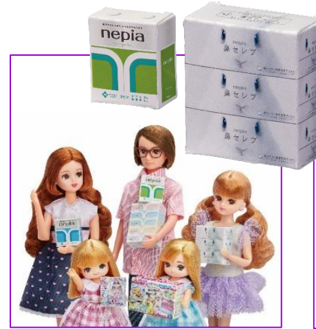
100 realistic small accessories are included. There are also authentic-looking items produced from the collaboration with oji nepia.