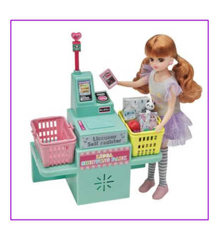
Scan items at the self-checkout register and make a cashless payment.

In addition, "LD-14 Happy Shopping," a doll separately sold wearing an outfit for shopping, comes with a shopping bag, which is substituted for a plastic bag.