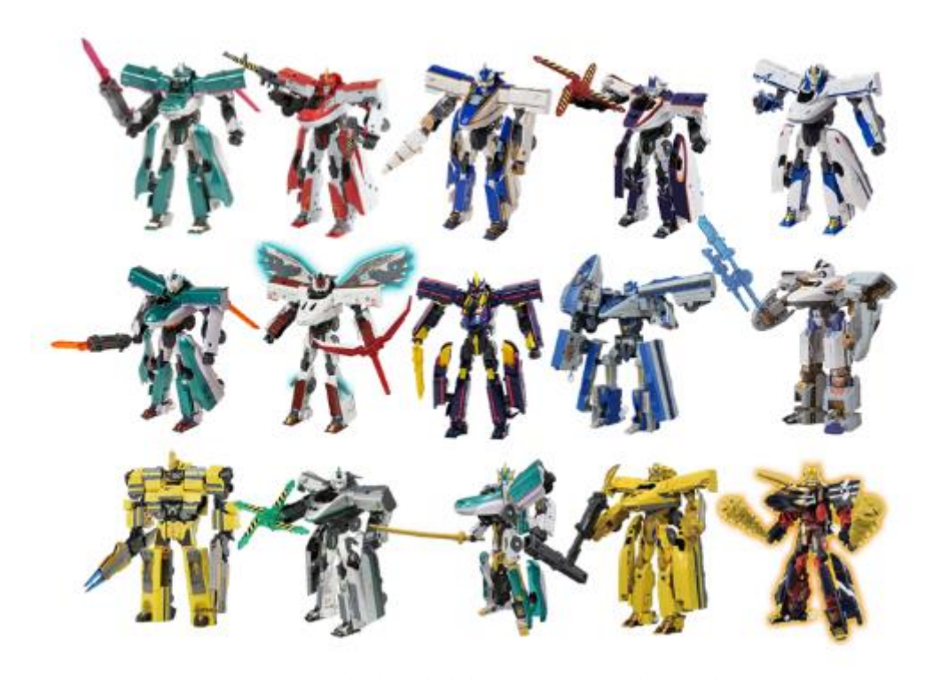
Part of Deluxe Shinkalion Series products released in the past

In "PLARAIL SHINKALION," 24 items including reproduced versions have been released since its launch in December 2017.