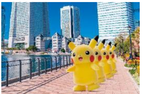
* The images are for visual representation purposes only.