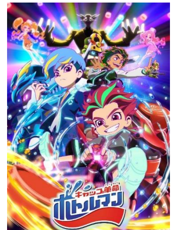
The 'BOTTLEMAN' animation is also starting!

The sensor mounted on Nintendo Switch recognizes the position and strength of the bullet that BOTTLEMAN shot at the target, and it is reflected in the score, so you can experience revolutionary play that has never been available before.