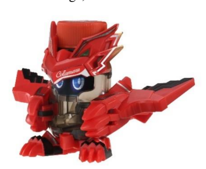
Power-type BOTTLEMAN! "BOT-01 Colamaru"