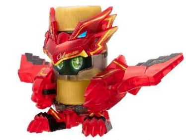
Comes with limited edition color "Colamaru"