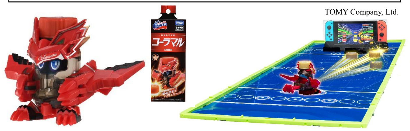
Main character shooter "BOT-01 Colamaru"

Original animation will also air on TOMY Company Official YouTube channel from Friday, October 9, 2020!