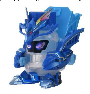
Speed-type BOTTLEMAN! "BOT-02 Aquasports"