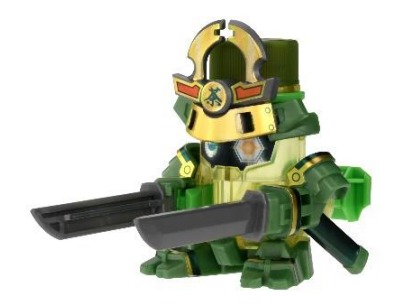
Control-type BOTTLEMAN! "BOT-03 Gyokurock"