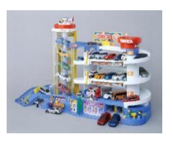
2010 "SUPER AUTO Tomica Building"

It debuted one year after the release of "Tomica Building." Truly a "deluxe" building with an increased number of floors from the normal "Tomica Building" from 3 floors to 5 floors, and it can now carry a Tomica car to the rooftop in one shot using the elevator.