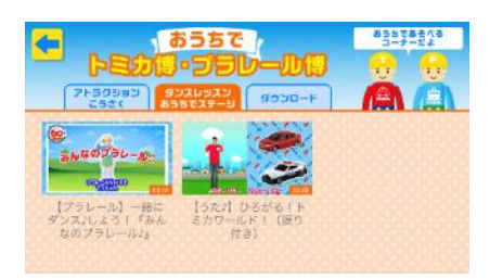
*The images are of the contents under development. Specifications are subject to change without prior notice.