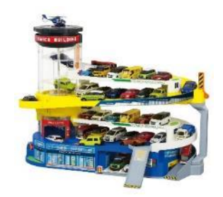
2020 "Double Action Tomica Building"

Major upgrade on the occasion of Tomica's 40th anniversary. Adopts an electrically operated spiral elevator which can take up to 5 Tomica cars at one time. It can be operated electrically or manually, and it allows you to continue running Tomica cars automatically, as well as connect to certain Tomica World products