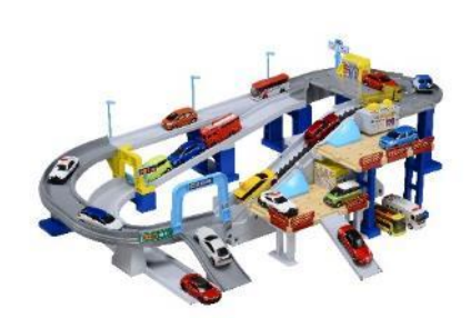
Image of "Tomica Action Highway" + "TOMICA ADVENTURE DRIVE" + "Double-Action Tomica Building" connected using a "connecting road"

* Tomica (miniature cars) are sold separately