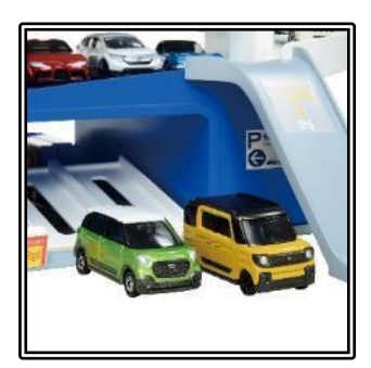
Shooter which can shoot out 2 cars simultaneously