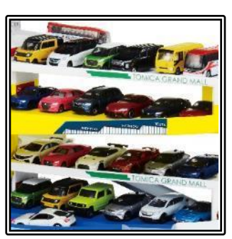
Up to 30 Tomica cars can be parked