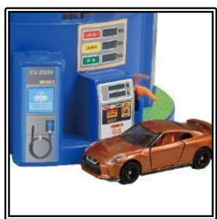
Pretend play to fill up at the gas station