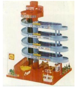
1972 "Tomica Building DELUXE"

It debuted as a product to expand the imaginary world of Tomica play, inspired by a multi-story car park, allowing you to run Tomica cars down the slope, line them up in the garage, and even pretend to refuel them, etc. The elevator is operated manually to carry cars to the rooftop one by one