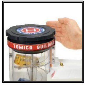
Elevator that can be switched between electric and manual modes

The most distinctive feature of "DOUBLE ACTION TOMICA BUILDING" is that the building structure can be adjusted in two modes. The top 2 floors of the parking area slide open, changing from "Compact mode" to "Dynamic mode." Depending on the mode, the elevator door exit changes, and you can enjoy changing the layout and course. Also, the elevator can be operated either electrically or manually. Transparent parts are used so you can enjoy watching Tomica cars go up from various different angles. In addition, you can park up to 30 Tomica cars in the parking space and have fun arranging them freely. It can also be used for tidying up/storage. Other features include a shooter for shooting out Tomica cars and a gas station with a movable pump nozzle, allowing you to create your own town with its own unique story by mixing in various scenes.