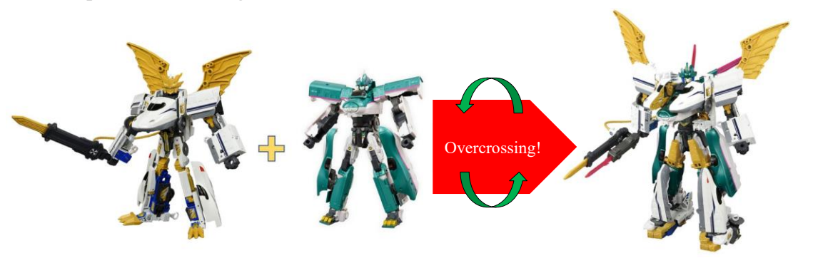
SHINKALION N 7 0 0 S NOZOMI SUPREME MODE

SHINKALION E 5 HAYABUSA PLUS (sold separately)