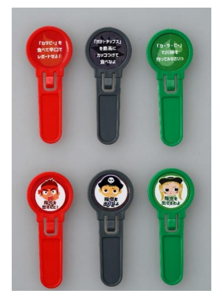
Swords (Pop-Up Pirate Waruhige Hot)

Includes "tell us a story about when you were most seriously scolded" and "tell us about when you cried recently and the reason why"