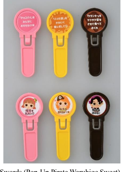
Swords (Pop-Up Pirate Waruhige Sweet)

Includes "share a 'Choco Pie' with everyone☆," "give us a cute food review on 'Pie No Mi'♡," "eat 'Toppo' like a hamster♡" and "do an impression of a character from 'KOALA'S MARCH,' mon♡"