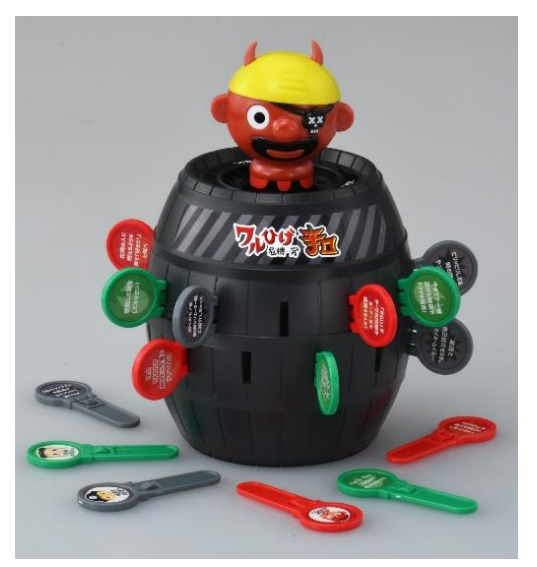
Pop-Up Pirate Waruhige Hot