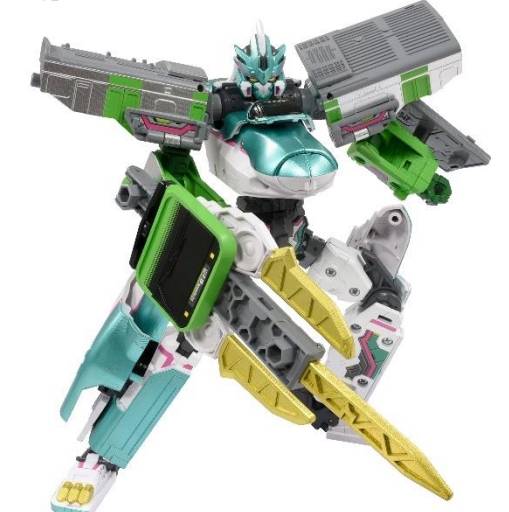
"SHINKALION Z E5 YAMANOTE," after a "Z combination" of "SHINKALION Z E5 HAYABUSA" and "ZAILINER E235 YAMANOTE"