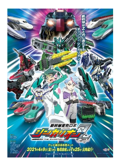
Main visual of the TV animation

As the first edition, TOMY Company will successively release a total of 10 items in the PLARAIL "SHINKALION Z" series, including "SHINKALION Z E5 HAYABUSA" (tentative price: JPY 5,280/tax included) and "ZAILINER E235 YAMANOTE" (tentative price: JPY 1,980/tax included), from April 2021 at toy stores, toy sections of department stores and mass retailers nationwide, online stores, specialty stores for PLARAIL products "PLARAIL Shops," and TOMY Company's official online store "Takara Tomy Mall" (takaratomymall.jp), etc.