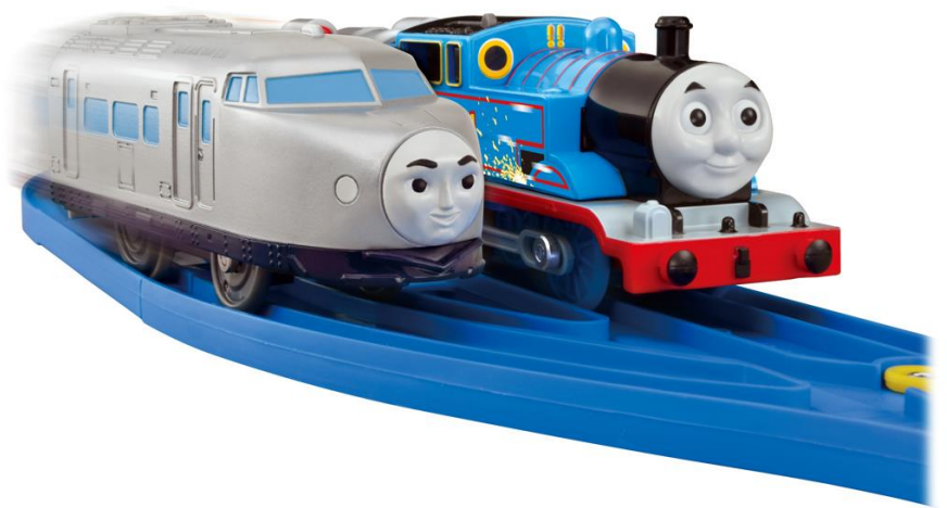
Some of the items included in PLARAIL "Thomas & Friends: Kenji and Thomas Tagging Set" (from left, Kenji and Thomas)