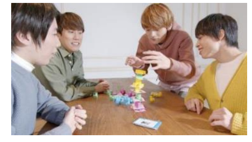
View of QuizKnock members playing with the product

In planning this product, we requested "QuizKnock," a media that fuses entertainment and intellect, to supervise the development, because we were inspired by their concept of "Fun and Learning Go Together." In adjusting the rules of each game and game balance as well as setting the competencies used in each game, the "University of Tokyo brains" of QuizKnock members were utilized to their fullest extent.