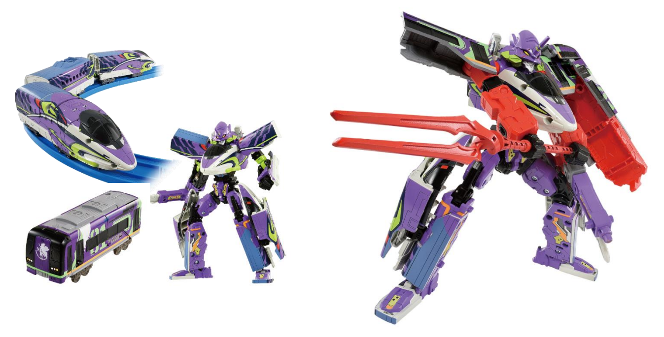
(Left) "Shinkansen 500 TYPE EVA" *tracks not included, "SHINKALION Z 500 TYPE EVA," "ZAILINER μ SKY TYPE EVA" (Right) "SHINKALION Z 500 μ SKY TYPE EVA," the "Z-combination" version with the "ZAILINER μ SKY TYPE EVA."

TOMY Company, Ltd. (Representative Director, President & COO: Kazuhiro Kojima, headquarters: Katsushika-ku, Tokyo) will launch its new product, the <u>PLARAIL "SHINKALION Z 500 μ SKY TYPE EVA</u>," (SRP: JPY 9,350/tax included) part of the "PLARAIL" railway toy series, as a spin-off toy for the television animation series "SHINKALION Z" on Saturday December 18, 2021. The toy will go on sale nationwide in toy stores, toy sections of department stores and mass retailers in Japan, the specialty store for PLARAIL products "PLARAIL Shops," online stores, and TOMY Company's official online store "Takara Tomy Mall. (takaratomymall.jp)