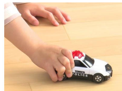
Size that is easy even for young children to hold

"First TOMICA," which has incorporated "elements that children love" and given "consideration to ensure that even 1.5-year-old children can have fun playing with the toy safely" with technology accumulated for over 50 years since the launch in 1970, is recommended for playing with Tomica toy for the first time.