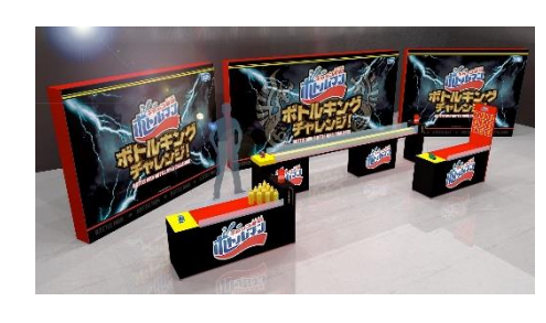
Illustration of Special BOTTLEMAN Challenge Stage

Bottle King. The goal is to complete all the stages and achieve complete