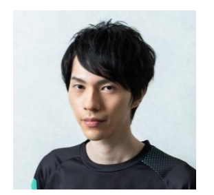
<First guests> Nephrite