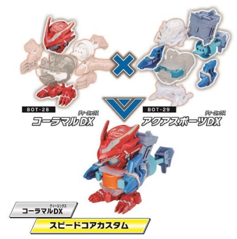
Modification Examples Colamaru DX and Aquasports DX

The designs of the shooters are inspired by the constellations of the Phoenix, Aquarius, and Canes Venatici. Shooters with other constellation motifs will be released in the future.