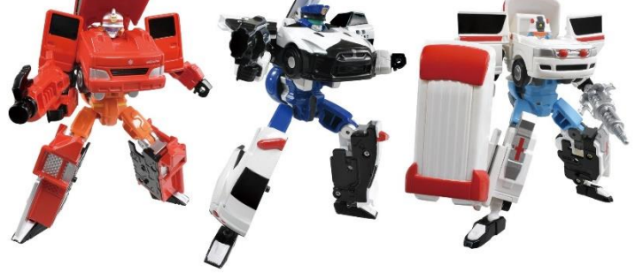
Key visual of "TOMICA Heroes Jobraver - Specially-equipped combined robot"