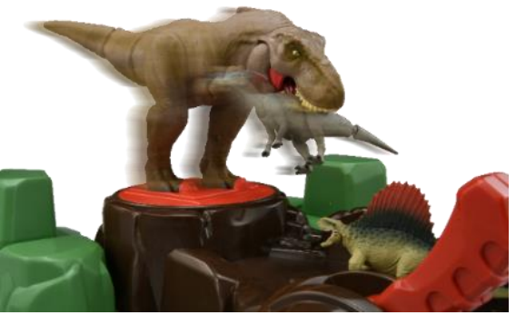
T. rex goes on a rampage with dynamic action, spinning around with ANIA figures and other items in its mouth

The T. rex's head and tail, in tandem with its vigorous movement, can knock around and scatter dinosaurs, rocks, and other debris in its vicinity. To ensure that even small children can intuitively operate the T. rex, the lever simply moves back and forth and the hand wheel rotates left and right, in tandem with the T. rex's movements. The giant T. rex can also be removed and held by hand to be played with as a figure, and the lever on its neck can be used to open its mouth and lift it up and hold other ANIA figures in its mouth.