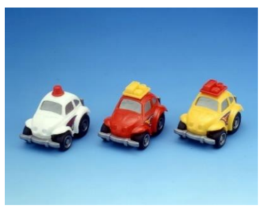
First generation "ChoroQ"

In 1980, TOMY COMPANY (then Takara) released "ChoroQ" as a pullback spring-loaded miniature car. The standard product was priced at JPY 350 per car at the time of its release, and a feature that allowed the front wheels to float and wheelie when a 10-yen coin was inserted into the back of the car also became popular. Variations were added in a variety of car models and colors.