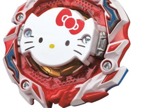
"B-00 Booster Astral Hello Kitty.Ov.R'-0"