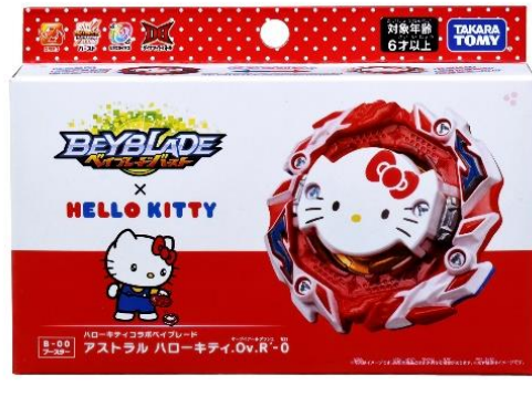
Product package with red and white used as its basic tone Cute design decorated with dots!

Official Website: beyblade.takaratomy.co.jp/products