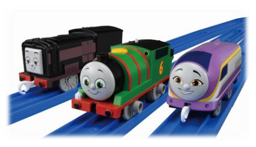
Go Go Thomas: Percy, Diesel, and Kana Friend Set

*Cannot run on the Loop-the-Loop Playland when connected.