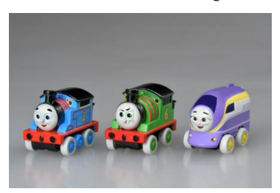
*Products still under development. Images are for illustration purposes only.