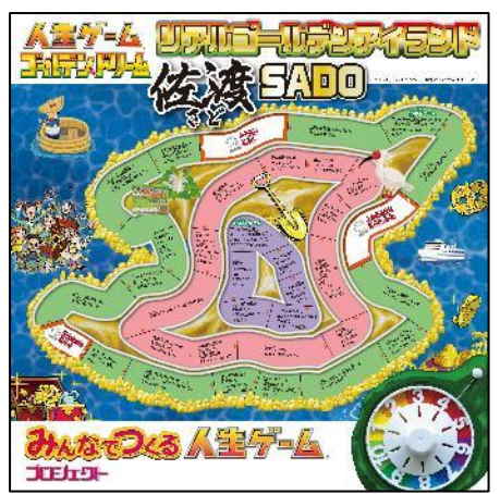
Completed Sado Island Course

Details: www.takaratomy.co.jp/products/jinsei/event/2210_sado/