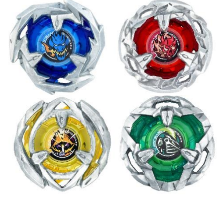
Top photo: Left: DRAN SWORD 3-60F, Right: HELLS SCYTHE 4-60T Bottom photo: Left: WIZARD ARROW 4-80B, Right: KNIGHT SHIELD 3-80N