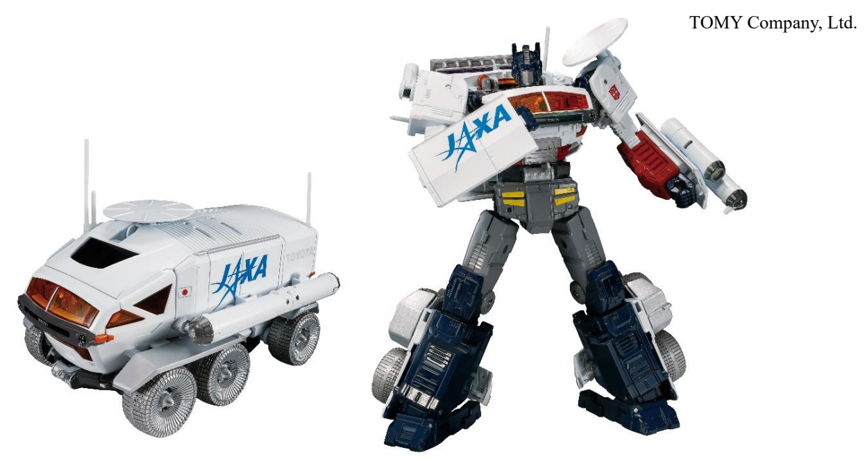
TRANSFORMERS "Lunar Cruiser Prime"

TRANSFORMERS "Lunar Cruiser Prime" Launches in March 2024