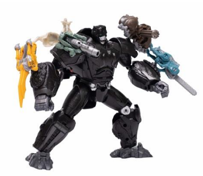
Can be combined with the separately sold "Rise of the Beasts: Rise Weapon" at various parts of the body for enhanced armament