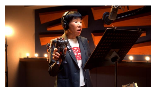
TRANSFORMERS "Rise of the Beasts: Rise of the Beasts Optimus Primal" Second commercial for the "Transformers: Rise of the Beasts" toy series