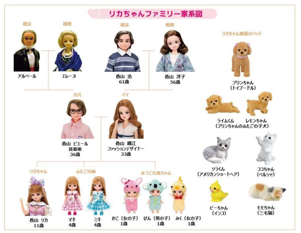
Note: "Elaine" (released in 1992) is currently discontinued.

With the heightened focus on family bonds and human connection during the COVID-19 pandemic, this product will be released as a way for grandfathers to play with their grandchildren and spend quality time together playing make-believe with LICCA dolls.