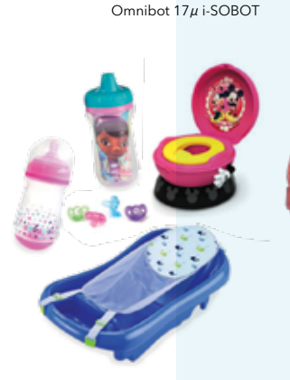
THE FIRST YEARS