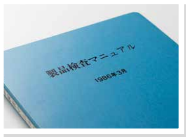
In 1963, we established an internal product inspection department. Later, in 1974, we formulated quality control regulations to raise product quality (pictured here is our product inspection manual used in 1986).

When we received the award, Sears commented that rather than bestowing the award upon the Company itself, it wished to grant the award to its employees, who made the superior products that justified the Company's selection. This comment continually reminds us to take pride in the quality of our products and fulfill our quality-related responsibilities.